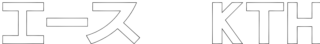
LABEL FOR ORIENTAL STYLE TILE (LOCATED ON UNDERSIDE OF TILE)

All tiles shall bear the imprint or identifiable marking of the manufacturer's name or logo (See Detail Below), or following statement: "Miami-Dade County Product Control Approved".